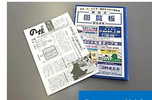
Reassurance with information

The "Noda City News" is full of useful informations. We serve as a bridge between citizens and the government by circulating PR papers and other informations.