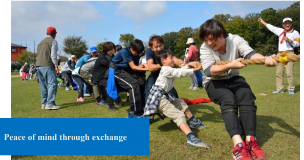
Peace of mind through exchange

Festivals and resident athletic meets are local events that can be easily attended, and the interaction between neighbors strengthens community ties.